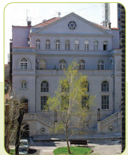
Belgrade synagogue Sukkat Shalom

A new period of prosperity for the Jewish community in Serbia began after the Second Serbian Uprising, in 1815. Besides the one in Belgrade, large Jewish communities were established in Niš, Šabac, Smederevo, and after the Balkan wars (1912-1913), in Priština, Bitola, Skopje and Štip as well.