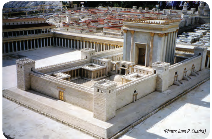
Model of the Temple in Jerusalem from the Israel Museum