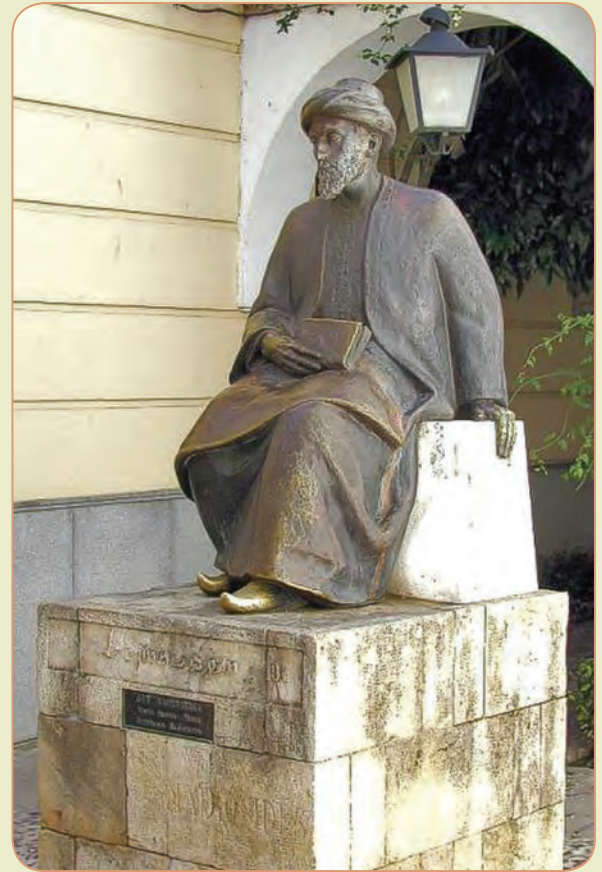
Rabbi and philosopher Moses Maimonides , monument in Cordoba

Among the Spanish Jewry there were a number of prominent artists and scientists. The most famous among them was the rabbi and philosopher Moses Maimonides. Born in Cordoba in the mid-twelfth century, he spent most of his life travelling, and eventually settled in Cairo, where he became the court physician to Sultan Saladin. He wrote in Arabic and Hebrew, and his works on philosophy, Jewish religion and tradition, as well as medicine, influenced the thought of a broad circle of scholars.