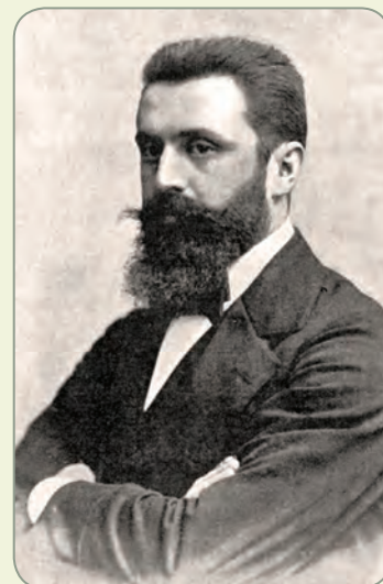
Theodor Herzl (1860–1904)

Theodor Herzl was a journalist, writer and political activist who is considered to be the creator of contemporary Zionism. Zionism is a movement that was based on the idea that the Jews should establish their own state and that they have the same rights of doing so as all other nations. The Jews should have their own state primarily in order to be protected from the centuries-long persecution and anti-Semitism, and that state should be established by returning to their native land of Palestine. Theodor Herzl was the initiator of the First Zionist Congress in Basel in 1897, where the Zionist Organization was founded. The State of Israel today considers Theodor Herzl to be its spiritual father. Theodor Herzl's family and his father Jacob were from Zemun, while he himself was born in Budapest. The graves of Rivka and Simon Herzl, Theodor Herzl's grandparents, are still found at the Jewish cemetery in Zemun. In 2018, a street in Zemun was named after Theodor Herzl.