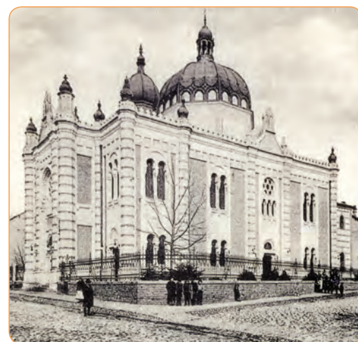
Synagogue in Zrenjanin was destroyed by the Germans in 1941.

Since the second half of the 19th century, the Jewish communities in Vojvodina strived to demonstrate their prosperity by constructing ever more beautiful synagogues. Besides the ones in Novi Sad and Veliki Bečkerek (today Zrenjanin), one of the most impressive synagogues is in Subotica, erected in the early 20th century, in the style of the Hungarian secession. There were 78 synagogues in Vojvodina, of which only three remain today. Many were destroyed during the World War II, and many fell into disrepair and collapsed in the decades after the war, due to the lack of maintenance and neglect, because many Jewish communities vanished completely in the Holocaust, and there were no more Jews left to look after their local synagogues.