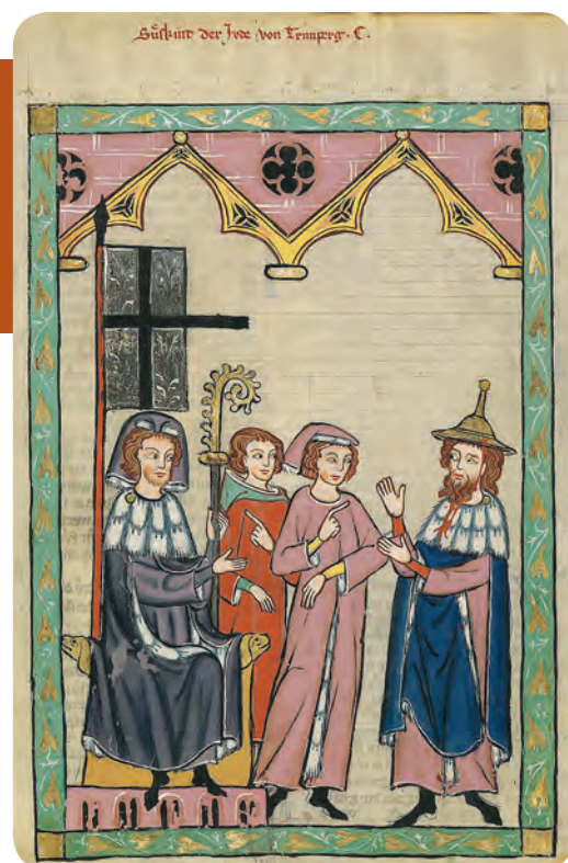
Süsskind, the Jew of Trimberg, illustration from the Codex Manesse

Prejudices – negative judgements or opinions about a person, a social group, or a phenomenon that are not based on true experience or on reasonable evidence.