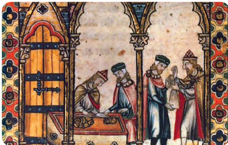
Jewish moneylenders in France, c 1270.

Thus, in Italy and England, for example, members of the Jewish community were often tailors. Some Jews were physicians, lawyers, translators, scholars, or engaged in other professions that needed special knowledge and skills. Forced to be constantly alert to the danger of another expulsion or pogrom, one of the motives for selecting such professions was that, even if they found themselves dispossessed and driven away, they could always apply their expertise in another country.