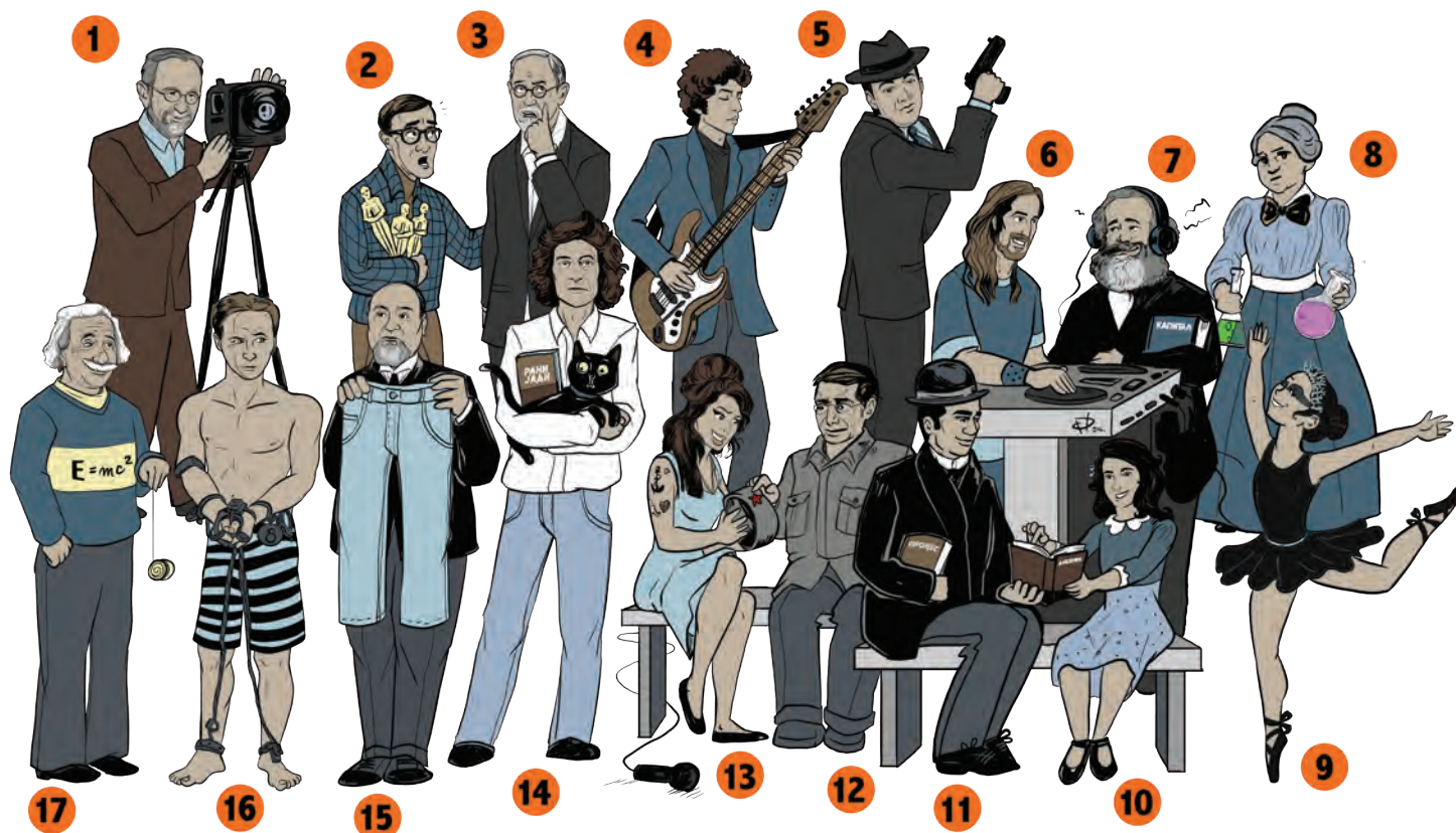
Illustration: Terraforming © terraforming.org, Illustrator: Nada Serafimovic

This illustration shows different famous people of Jewish origin. Can you recognize who is who?