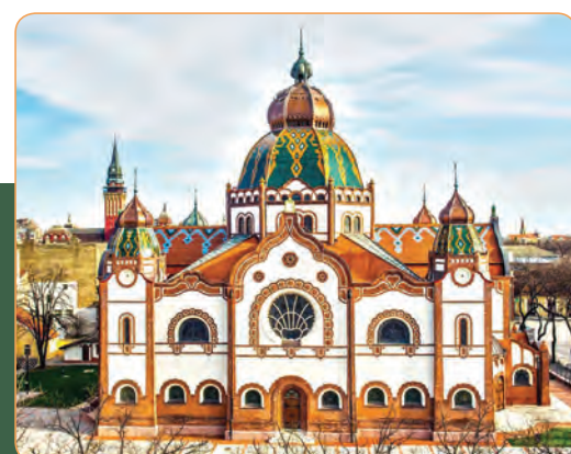
Subotica Synagogue today

After many years of restoration works, the reconstruction of Subotica Synagogue was completed in 2018. The synagogue in Subotica is one of the most beautiful sacral buildings in Serbia, and the second largest synagogue in Europe.