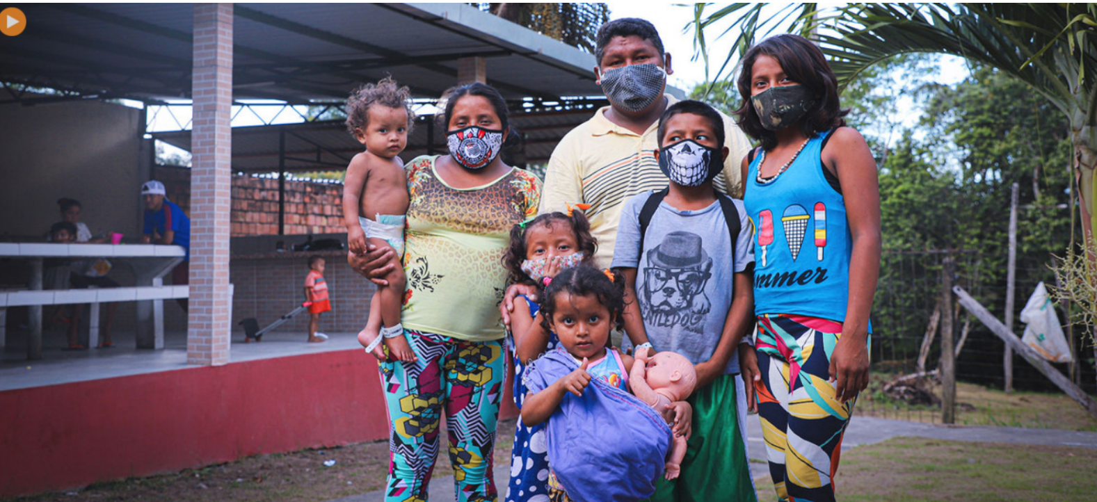
Venezuelan Warao refugee families arrive at a newly opened UN shelter in the Tarumã-Açu neighbourhood of Manaus, northern Brazil.