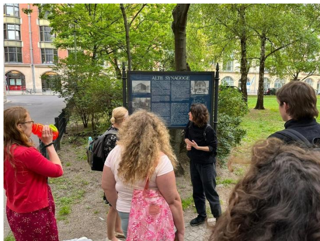
Photo: participants during the seminar in Berlin in May 2022, conducted by Centropa

You can read more about past HANNAH seminars here .