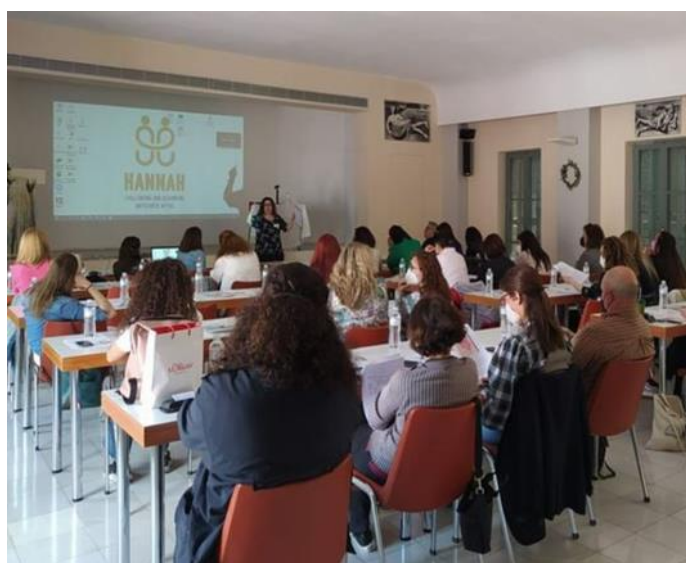
Photo: participants during a seminar in May 2022, conducted by the Jewish Museum of Greece

Four training seminars in each country are organized by each HANNAH project partner to enhance knowledge on local Jewish history and the Shoah, and increase awareness on antisemitism, develop innovative tools against antisemitism, and contribute to combating it through capacity-building, awareness raising and policymaking.